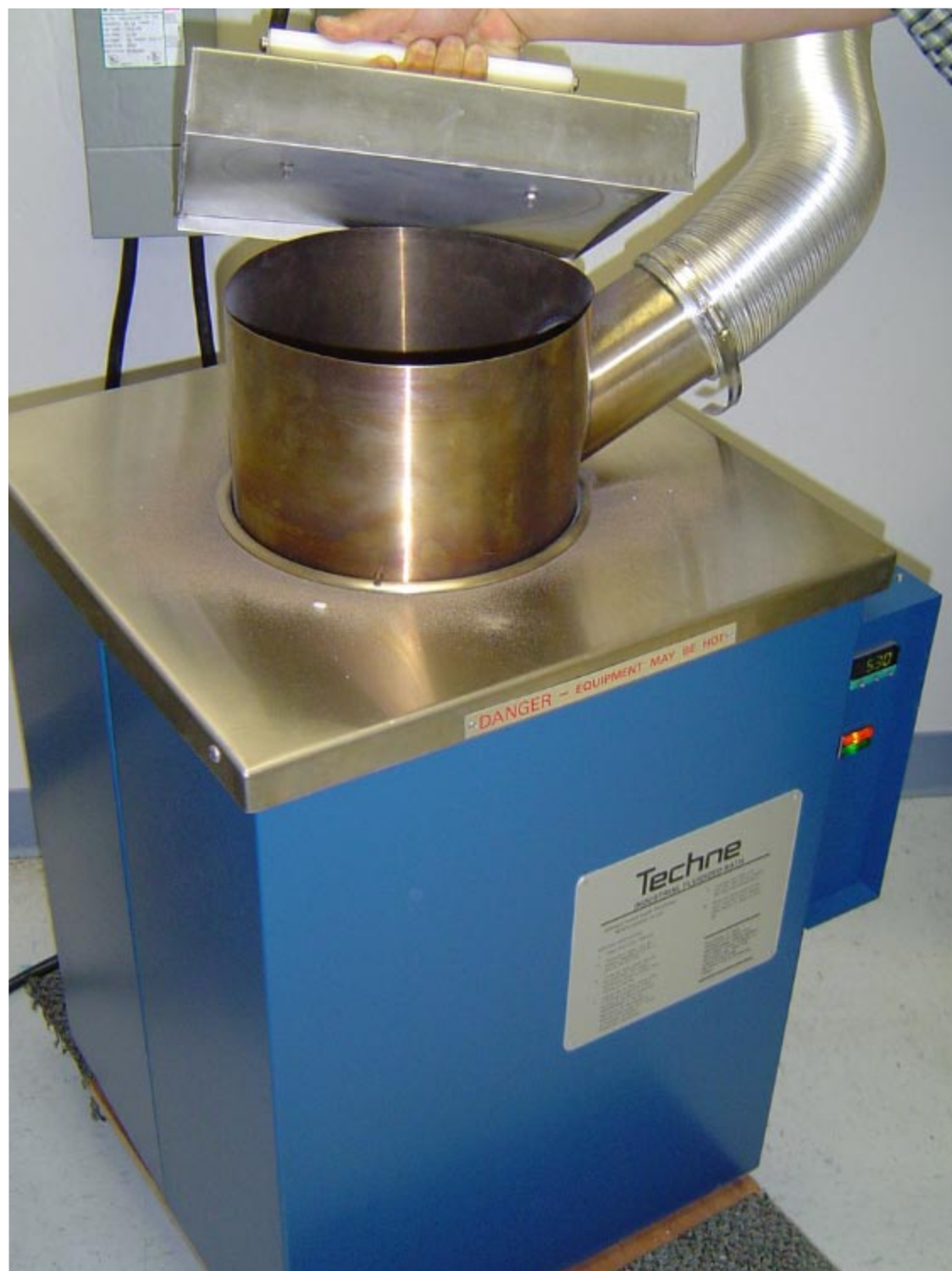
View inside the extraction collar