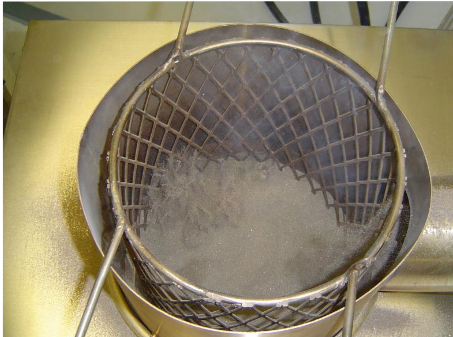
Small amount of fumes & smoke are exhausted out to the right