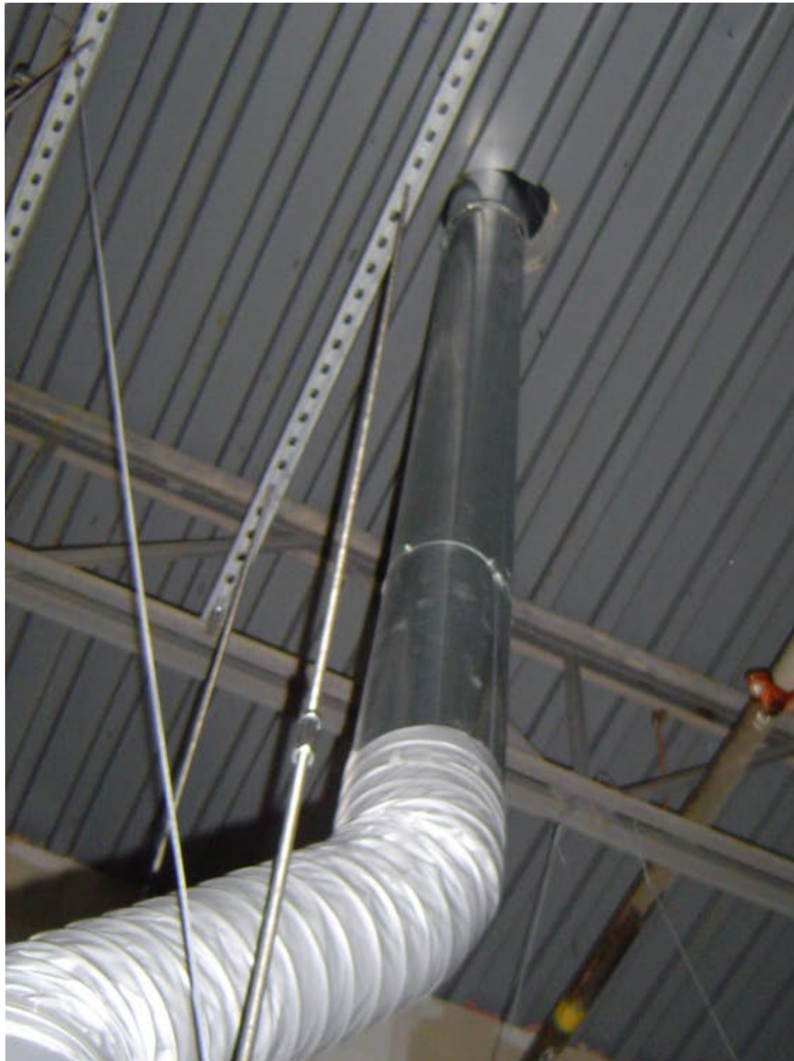
Exhaust extraction out the roof stack