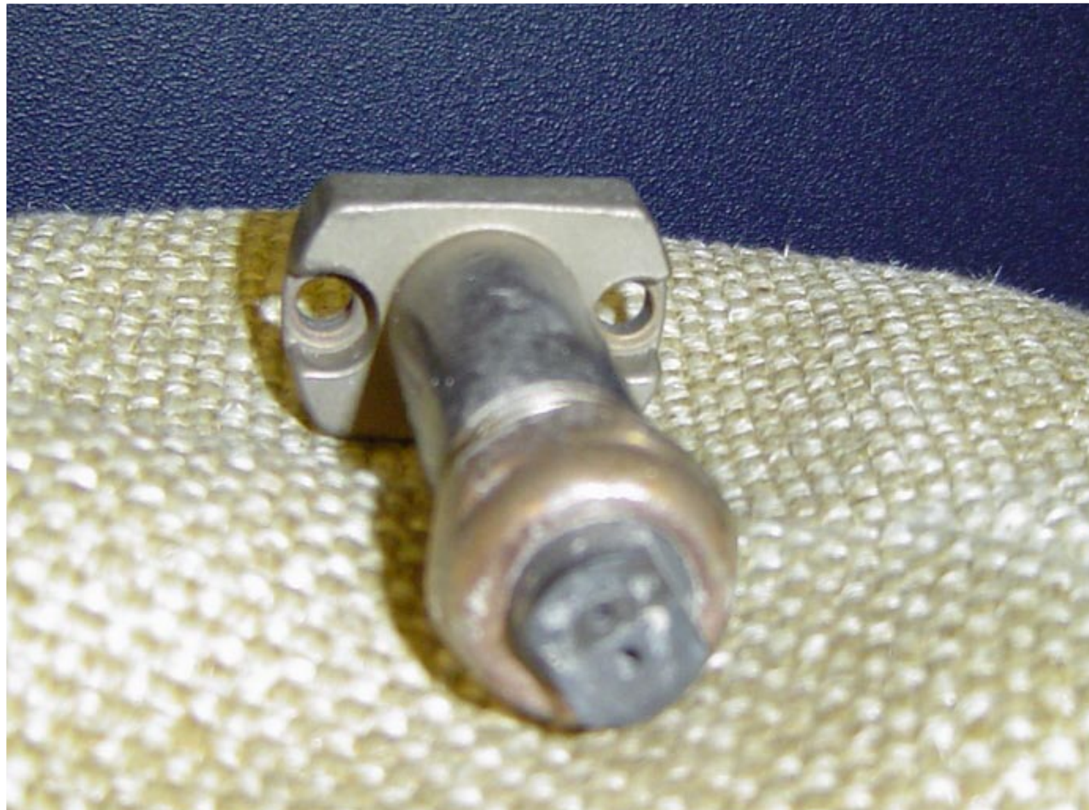
Close up of clean part though still hot