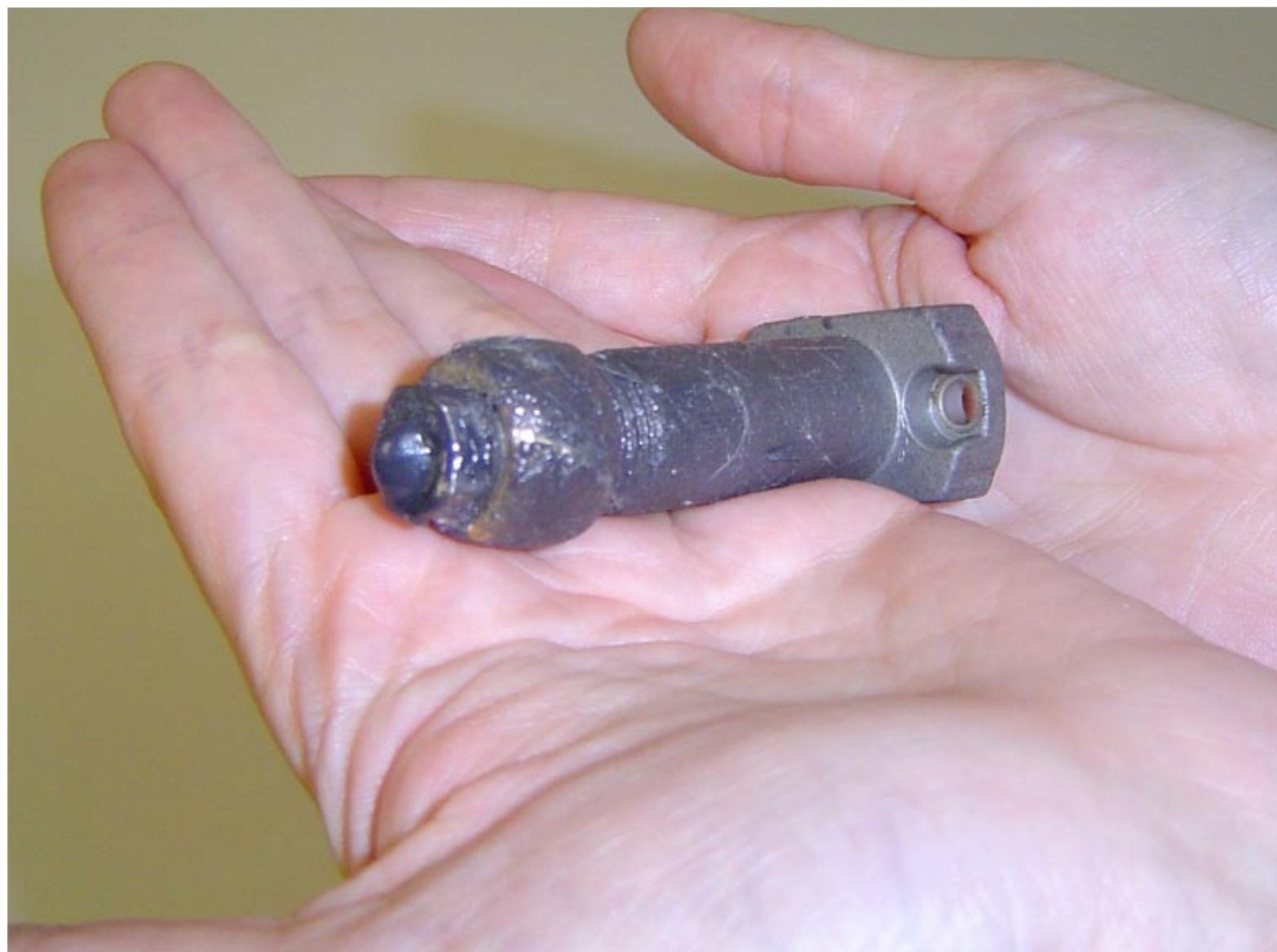
Part before cleaning