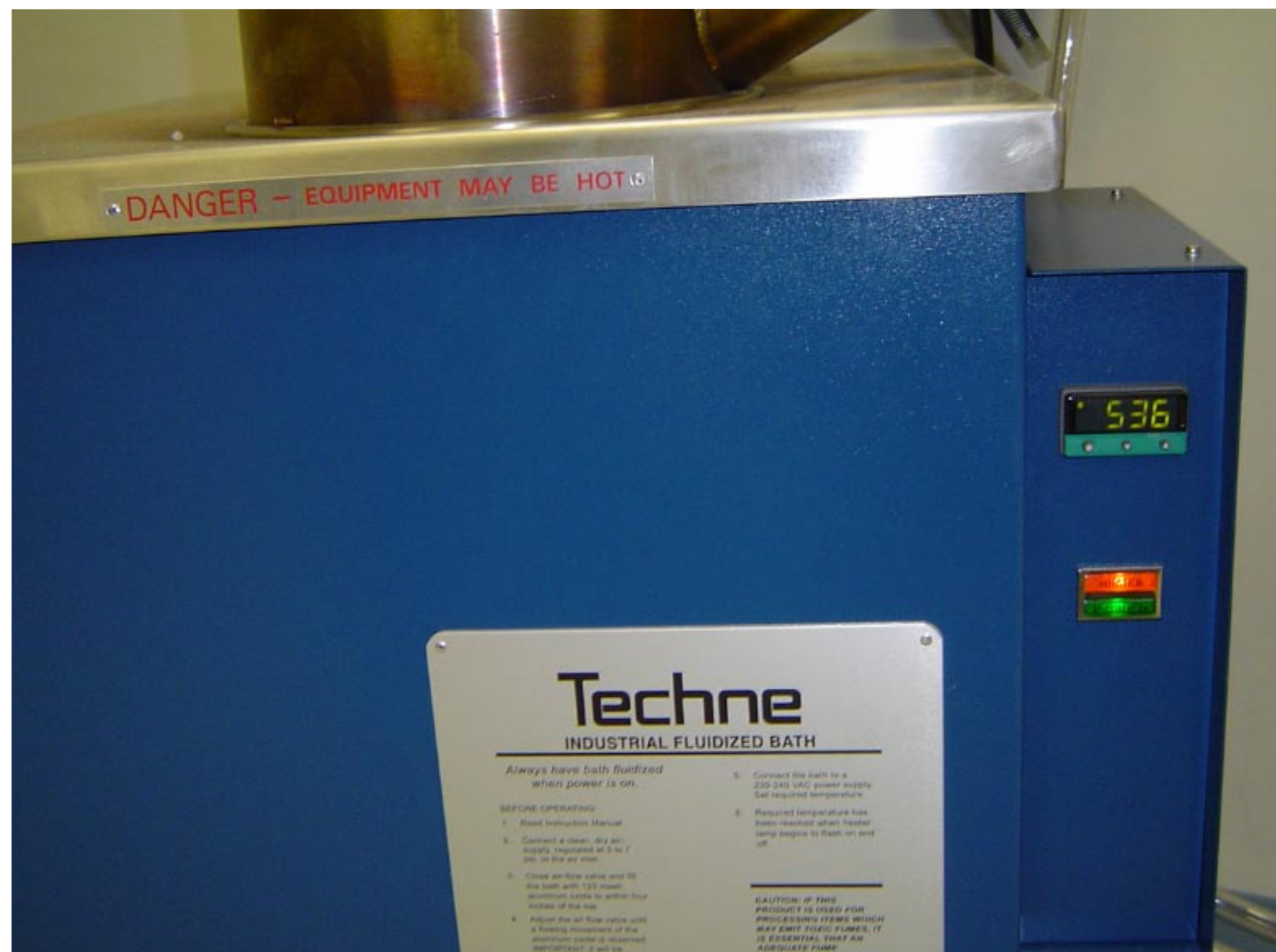
IFB51 at temperature in Celsius