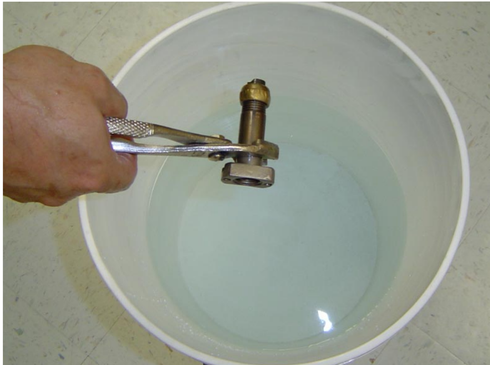
Cleaned part being quenched in a bucket of water