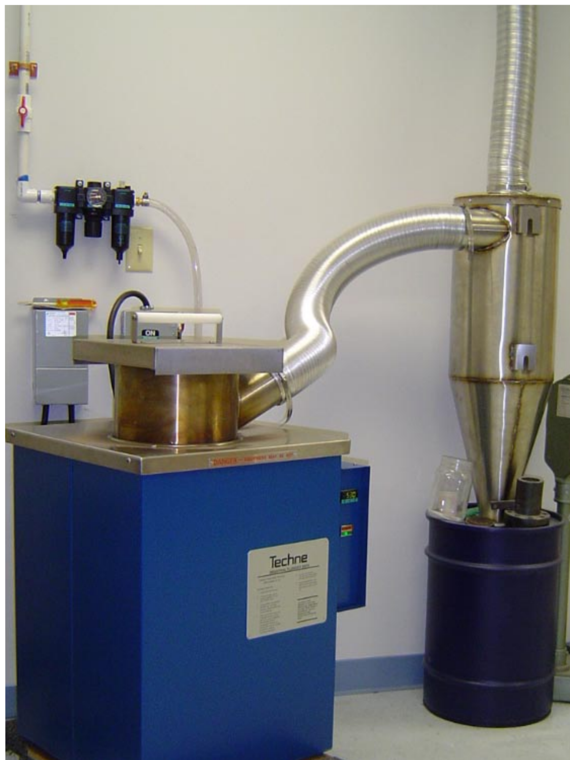
IFB51 setup with fume extraction accessories